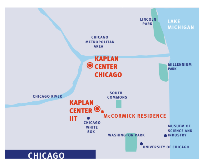
Location of Kapaln's Chicago Centers and McCormick Residence

McCormick Student Village 3241 S. Wabash Chicago IL 60616