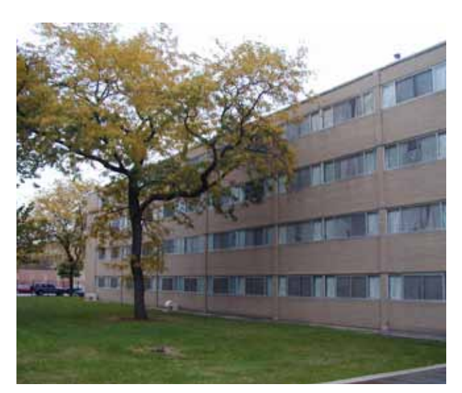
McCormick Student Residence

It's an extremely secure place to live because all students must enter and exit through the same central doors of the building, where a door guard is posted 24-hours a day. The student ID is called the 'Hawk Card' and is used as a personal ID, for gaining entry into the residence halls, as a meal card, for laundry, photocopying and vending machines.